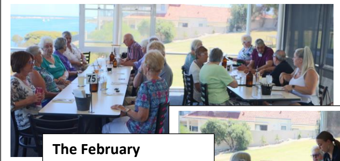
The February weekend social was a lunch at the “Cut Tavern” on the Dawesville cut.