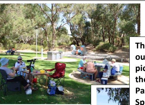
The March outing was a picnic lunch at the “Quarry Park” Meadow Springs.